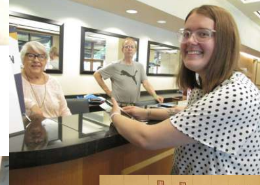
before game time.