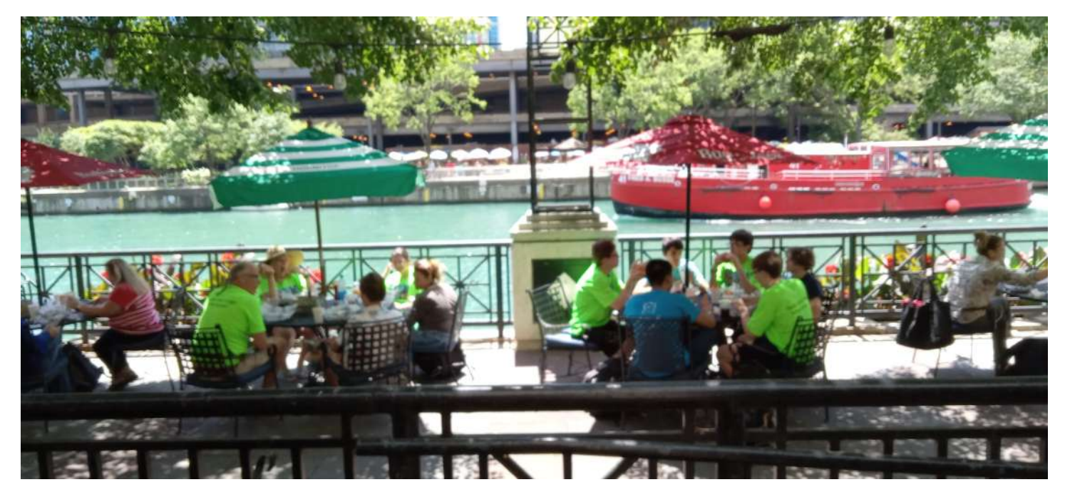
Young people attending the youth events were among those taking advantage of the beautiful weather to eat outside the Sheraton Grand Chicago, the host hotel, to enjoy lunch on the Riverwalk, and to watch the boats go by.